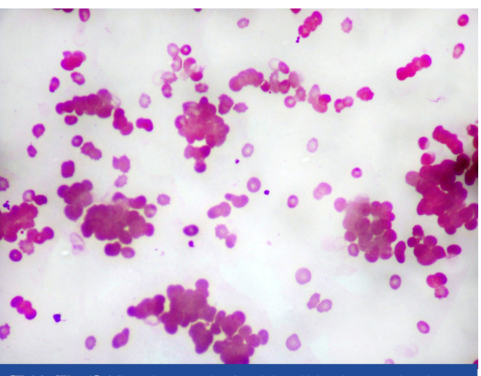
[Table/Fig-2]: Microphotograph of peripheral blood smear showing spontaneous agglutination of RBCs. (Leishman stain X1000)

volume (MCV: 114fl), mean corpuscular haemoglobin concentration (MCHC: 69.7) and red cell distribution width (RDW: 18.1) values along with a very low RBC count (0.81 million/cu mm). This problem was encountered while his blood group was being determined. The patient was B positive but he was reported as AB positive due to the spontaneous agglutination on the slide. The spontaneous agglutination of RBCs was also appreciated along the sides of the test tube which contained the patient's blood sample [Table/Fig-1]. The peripheral blood smear showed RBC agglutination [Table/Fig -2]. The patient also had leucopaenia and thrombocytopaenia. The Coomb's test was positive. The patient also gave a history of similar episodes which occurred during the winter months and febrile illnesses over the past four years for which he underwent many hospital admissions. His bone marrow examination did not reveal any abnormality. His protein electrophoresis was normal and his liver enzymes were mildly elevated. The patient tested negative for